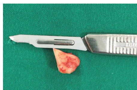
FIGURE 3: Third molar removed.

Bimanual examination can help finding the fragment location, associated to radiograph and tomography images, seeking for the exact local, especially in cases of lower tooth displacement. The advantages of external pressure include avoiding displacement of the fragment, elevation of the mouth floor, and palpation of the area. However, this approach is not recommended if patients present edema or obesity [1]. In case displacement of a dental element into facial spaces occurs, careful thinking should indicate the management procedures to be adopted. Attempts of immediate removal with lack of skills or lack of anatomic and surgical knowledge may worsen the condition by deepening the fragment or moving it into adjacent spaces [5].